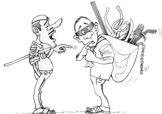
A PERSON UNABLE TO EXPLAIN FOR CARRYING INSTRUMENTS FOR HOUSE BREAKING CAN BE ARRESTED