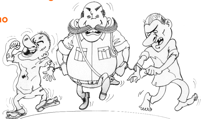
USE OF HANDCUFFS BY POLICE IS CONDITIONAL