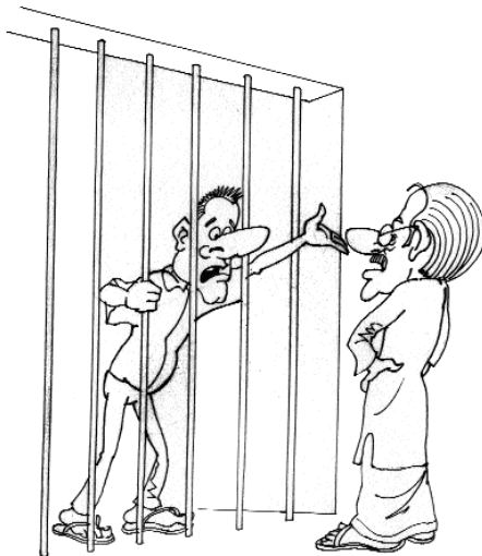
A PERSON IN POLICE CUSTODY HAS A RIGHT TO INFORM HIS FRIENDS AND RELATIVES

allowed Ramu Kaka to meet Dadaji. Ramu Kaka wept and said to Dadaji "I can't stay in prison - who will look after my family while I am here? Please, please help me".