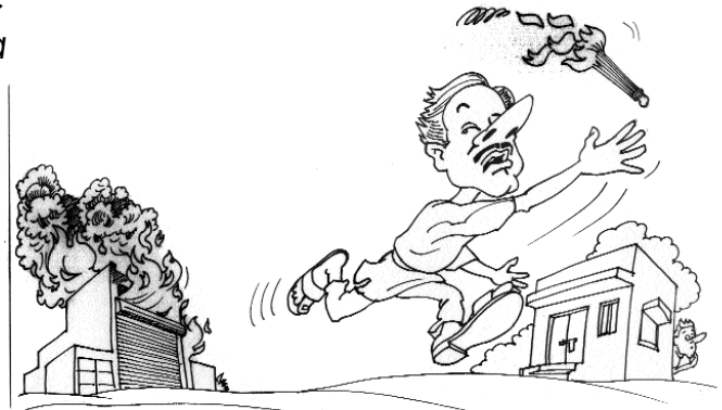
KRISHNA RUNNING AWAY AFTER COMMITTING A COGNIZABLE OFFENCE

"Have you thought of applying for anticipatory bail, Vineet?" Dadaji asked. "What is anticipatory bail?" asked Vineet.