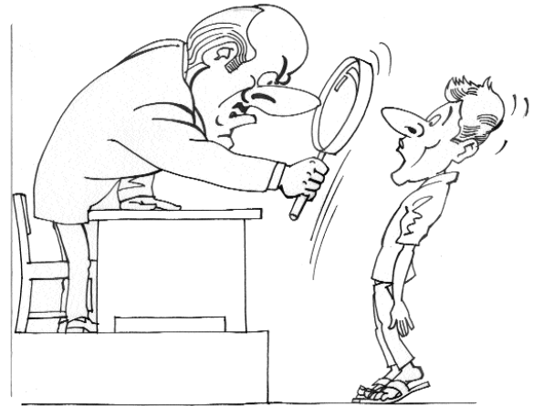
DECIDING WHETHER TO GRANT BAIL