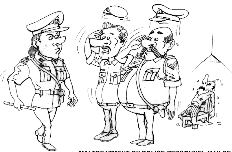
MALTREATMENT BY POLICE PERSONNEL MAY BE REPORTED TO SENIOR OFFICERS

other higher officers like the Deputy Inspector General of Police or the Inspector General of Police. You could even complain to the Superintendent of Police by sending a letter by registered post."